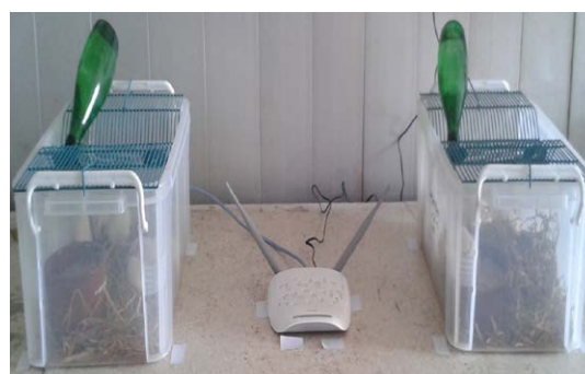
Figure 1: The experimental design.

Determination of catalase (CAT) activity: Catalase activity was measured using Biodiagnostic Kit No.CA 25 17 which is based on the spectrophotometric method described by Aebi (1984) [18]. Briefly, the catalase reacts with a known quantity of hydrogen peroxide and the reaction is stopped after 1 min with catalase inhibitor. In the presence of peroxidase, the remaining hydrogen peroxide reacts with 3, 5-Dichloro-2-hydroxybenzene sulfonic acid (DHBS) and