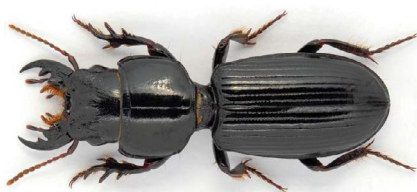
Figure 1: Parallelormorphus laevigatus .

Assessing the possible transfer of each metal through the food chain, we considered the metal burden in P. laevigatus (predator) and in its prey T. saltator . We can affirm that the concentration of As, Cr, Cu, Ni and Se in animal tissue differs in the beetles and in the sandhoppers according to their trophic role inside the ecological net. Differences in concentration for Cd, Co, Fe, Hg and V were correlated to both trophic level and sampling site, while Mn concentration differed among sites in a different way for the prey and predator. Moreover, the transfer trophic coefficient (TTC) (i.e., the ratio of the metal concentration in the beetles to that in their prey) is particularly high (approximately 5) for Hg.