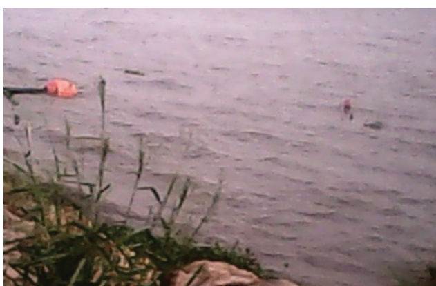
Figure 5: A high turbid water at one of the dredging sites.

benthos due to turbidity or side casting activities, increased turbidity, and alterations to current patterns, sediment, water quality, salinity and tidal flushing (Figure 7). Direct dredging effects to fish may include capture and killing by dredge equipment, disruption of normal foraging or spawning behaviours, and gill injury from exposure to local increases in turbidity [28].