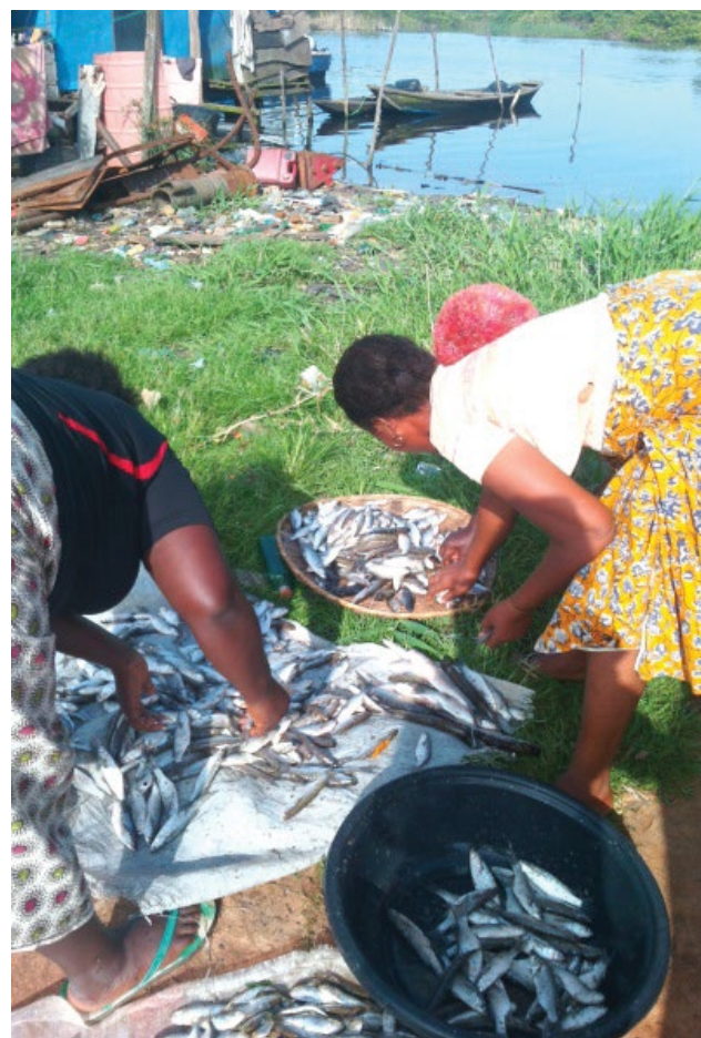
Figure 3: Sorting of fish at Elubo, Epe.

Effects of sand dredging on aquatic habitat include habitat removal, removal of existing benthic populations, burial of nearby