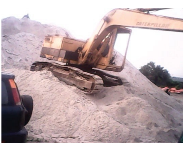
Figure 2: A nearby dump site for dredged sand at Bayeku.

environment which by extension affects fishing activity [17]. Increasing demand for sand for construction purpose and the supply gap created by dredging on land has made river/sea sand dredging a major threat to aquatic habitat and fishing as a means of livelihood (Figure 4). The ability of artisanal fishing to play its crucial role of a food supplier, employment provider and income earner in the Nigerian economy depends on the adoption of appropriate management strategies that will ensure sustainability of the sub-sector in the face of increasing human population in fishing communities and other human activities; such as sand dredging which is now common in most fishing communities [18].