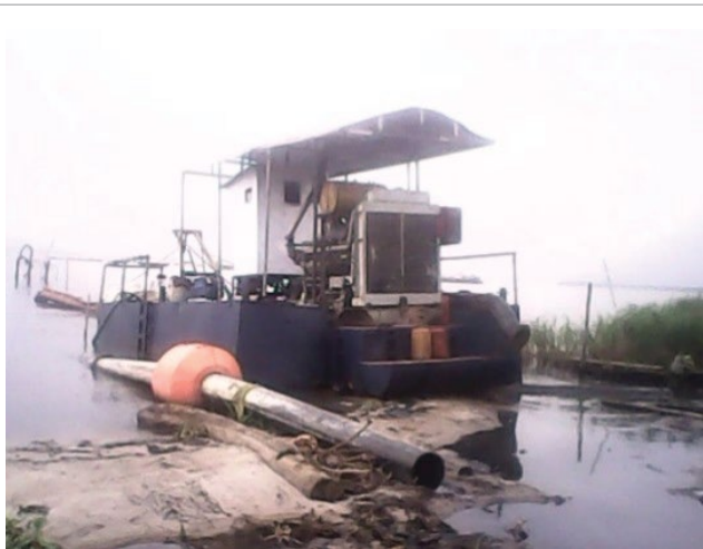
Figure 1: A dredger in action at Epe, Lagos State.