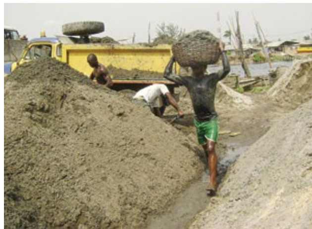
Figure 6: Local sand miners Majidun beach, Ikorodu.

In any production activities including pseudo production taking place in artisanal fishing, costs are incurred. These costs can be broadly divided into fixed and variable costs. Fixed costs are depreciation costs on fixed items such as canoe, paddle, net, basket, trap, rope among others. Variable costs are costs that do vary with output, and they are also called direct costs. Since artisanal fishermen are not involved in