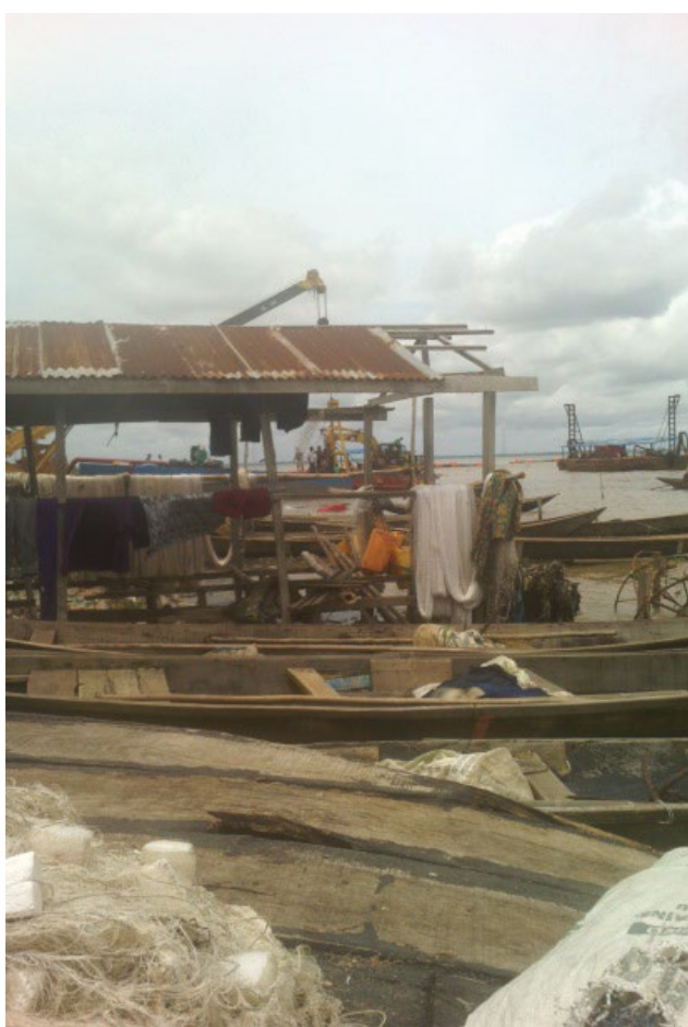
Figure 4: Typical fishing shed with dredging activity at the background at Baayeku.