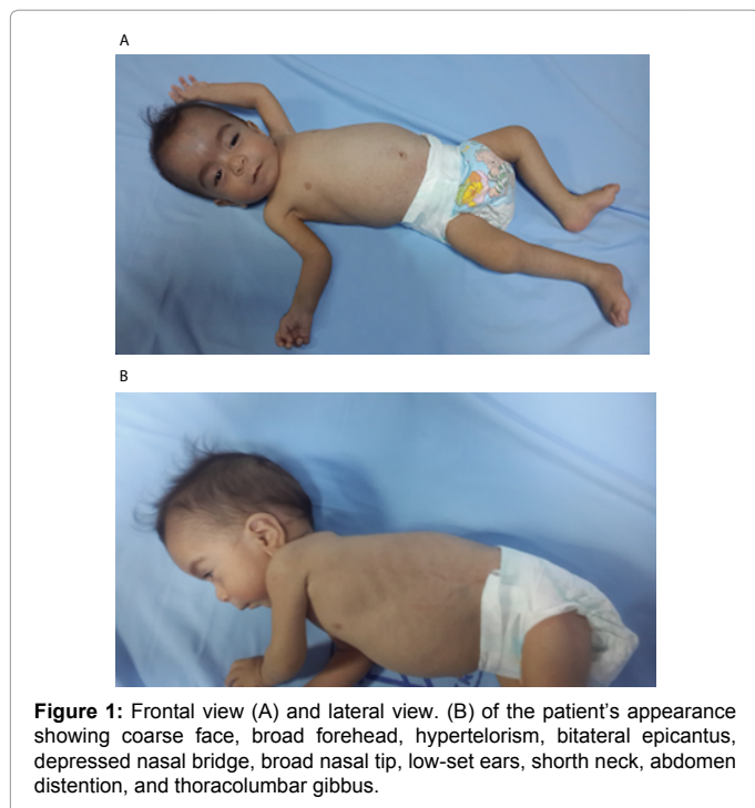
Figure 1: Frontal view (A) and lateral view. (B) of the patient's appearance showing coarse face, broad forehead, hypertelorism, bilateral epicanthus, depressed nasal bridge, broad nasal tip, low-set ears, shorth neck, abdomen distention, and thoracolumbar gibbus.