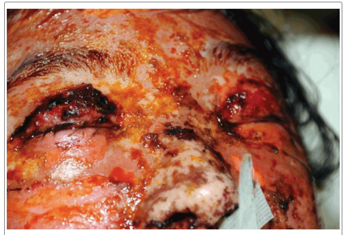
Figure 1: Appearance on Arrival at Queen Mary Hospital, Hong Kong China. Appearance showing extensive exfoliation of the epidermis.

conjunctivitis, dermal sloughing on 2<sup>nd</sup> July 2012. Three months prior, she started on an unknown regime of Traditional Chinese Medicine for irregular menses, and immediately before admission, the patient took oral cefuroxime and diclofenac for an upper respiratory tract infection for two days. On admission the patient was initially diagnosed with Stevens-Johnson's Syndrome (SJS) with 10% skin involvement. She was started on high dose intravenous methylprednisolone and intravenous immunoglobulin. Despite the measures, her skin involvement reached >30% by the 5<sup>th</sup> of July and was now complicated by respiratory failure and thrombocytopenia. The diagnosis was subsequently labelled as toxic epidermal necroylsis (TEN). She was intubated under sedation and transferred to the pediatric intensive care unit, Queen Mary Hospital, Hong Kong for continued care on the same day (Figure 1).