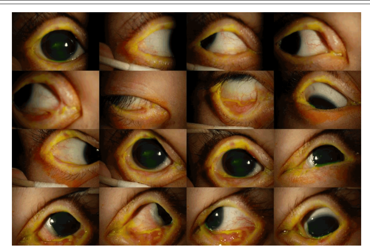
Figure 5: Post-operative Week 20. There was residual keratinization of bilateral lid margins and left nasal cornea. Extraocular movement was normal. From left to right, top to bottom photos 1-11 are of the right eye, while photos 12–16 of the left eye.

Figure 4: Post-operative Week 7. Amniotic membranes have resolved. Bilateral eyelids show residual erythema. There is keratinization of the nasal cornea. The photo on the right is of the right eye and photo on the left is of the left eye.