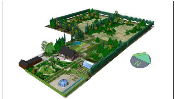
Figure 1: Alnarp rehabilitation garden illustration by Gunnar Cerwén.

Research at SLU in Alnarp has identified eight basic Perceived Sensory Dimensions (PSDs) in garden and nature areas. Together, these eight dimensions could define a spectrum of multisensory experiences, of sight, hearing, smell, taste, touch, temperature, proprioception and balance, which could offer good conditions for a multimodal treatment (Stoltz and Grahn, 2021). Alnarp Rehabilitation Garden was designed to contain all eight PSDs [9]. The garden also contains a gradient from de-stressing and relaxing parts for rest and contemplation to active and challenging parts, with cultivation and social activities (Figure 1).