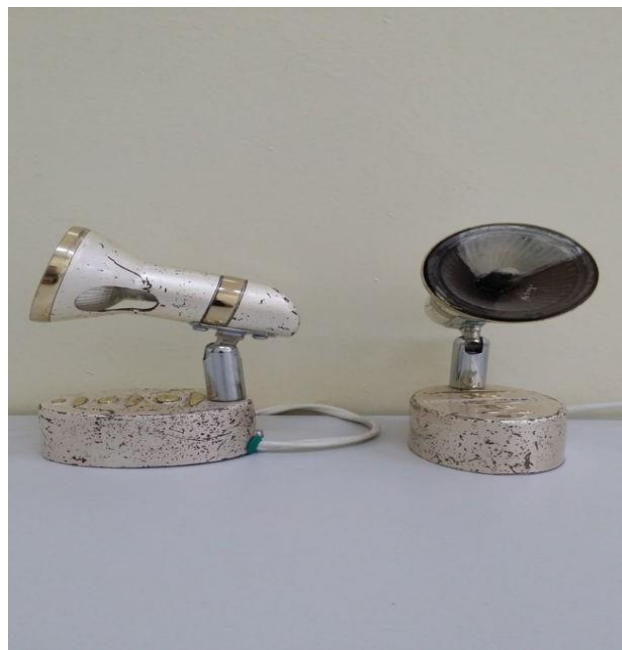
Figure 3: Far-range infrared emitters of ZB series.

56 and more years-11 patients. After the examination, which included the questionnaire International Index of Erectile Function -5 (IIEF-5), dopplerography of the cavernous arteries of the penis, patients were treated with long-range narrow-spectrum IR emitters according to our method: 8 sessions of 15 minutes twice in a day with GI and ZB series emitters type "Chair"; locally on the penis area the radiator of the ZB series (wavelength 22 \mu\text{m} ) for 3 minutes twice in a day, 8 sessions per treatment course (Figures 3-5).