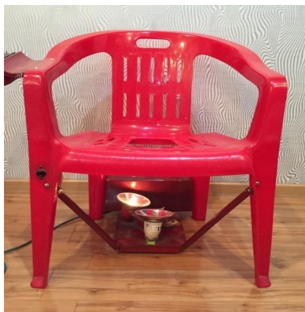
Figure 4: Far-range infrared emitters of the GI and ZB s series of "Chair" type.