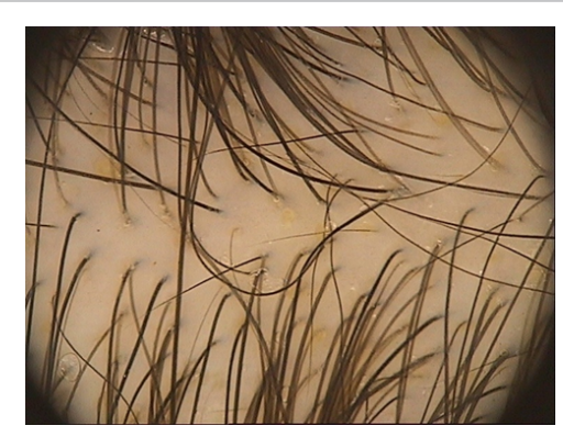
Figure 2: Scalp videodermoscopy showing yellow dots, miniaturized hairs and short regrowing hairs.

loss. Differential diagnosis includes several cicatricial or noncicatricial alopecias, the most common causes being telogen effluvium and androgenetic alopecia. The diagnosis is based on the history and clinical examination, associated with diagnostic techniques such as the pull test and videodermoscopy, and sometimes histopathology.