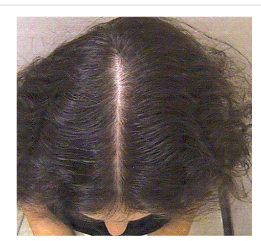
Figure 1: Clinical features: diffuse hair thinning, more evident on androgendependent scalp.

Hair loss is very common in women, at any age. It can appear as increased hair loss or as diffuse, patchy or patterned hair thinning. In all cases, it is associated with severe psychological distress and decresead self-confidence that are not proportional to severity of hair