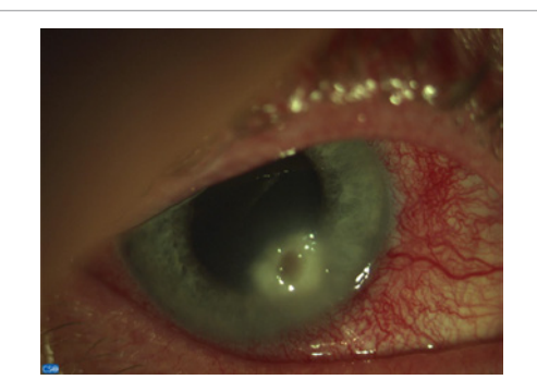
Figure 2: Progression of ulcer and corneal thinning.