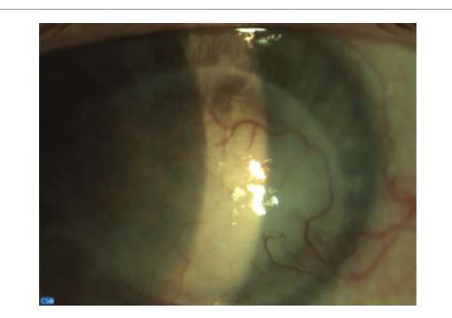
Figure 7: Dense vascular leucoma, wall to wall anterior synechias and mature cataract.