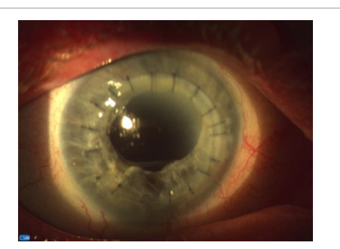
Figure 8: Right eye 1 month after penetrating re-keratoplasty, anterior segment reconstruction surgery and IOL implantation.

awareness of and experience with the management of these mycoses [5]. Moreover, fungal infection can be associated with invasion of epithelia by previous bacterial infection. Diagnosis of mycotis keratitis is based on clinical presentation, non-invasive in vivo methods together with in vitro conventional microbiological investigations and molecular methods. Non-invasive techniques include confocal microscopy, and anterior segment optical coherence tomography that allow in vivo examination of the cornea [2].