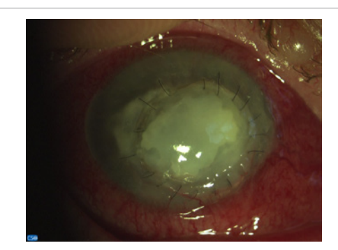
Figure 5: Severe ulcerative keratitis and endophthalmitis 4 months after the first hospitalization.

corneal abscess was excised and a corneal graft (7.25 mm diameter) was sutured into the normal corneal tissue. Investigation of the anterior chamber isolate identified the presence of Staphylococcus hominis. The excised cornea was processed for histology and staining. Histological examination by hematoxylin-eosin stain revealed a purulent abscess in the substantia propria under the corneal epithelium (Figure 4). Histochemical Gram stain was negative for detection of bacteria. Special Grocott's silver stain failed to confirm the presence of fungal organisms.