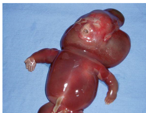
Figure 2: Abortive product cystic hygroma of the neck associated with foetal hydrops.

Contrasting with chromosomal abnormalities, older women are not at a higher risk of CH. In our series, 78% of the patients were young (under 35 years old). By the way, no risk features for CH have been identified in literature.