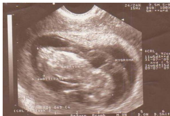
Figure 1b: Obstetrical ultrasonography at 10 WP Enormous nuchal Cystic Hygroma.