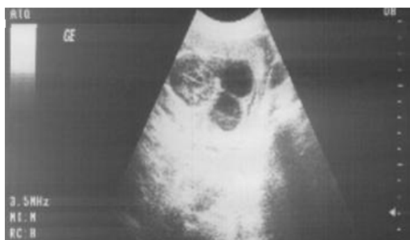
Figure 1a: Obstetrical ultrasonography at 10 WP Bi parted off Cystic Hygroma retro cervical.

The CH of the neck is the most screened anomaly during the first trimester of pregnancy. Its prevalence is about 1 % of all the ultrasonographic exams during the first trimester and it represents 10% of all the malformations diagnosed during the second trimester of pregnancy. On term, its frequency is about 17/100 000 births [5]. This decrease in frequency is due to the high rate of spontaneous abortion, intra uterine foetal deaths and of therapeutic pregnancy interruption.