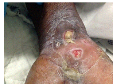
Figure 1: Ulcerations of the right ventral wrist and palm.

Dermatology was consulted in the inpatient setting to evaluate ulcerations on the wrist of a 68-year-old Panamanian male present for at least one week (Figure 1). The patient had originally been admitted approximately one month prior for dehydration, increasing weakness, diabetic ketoacidosis and acute kidney injury. He was soon after transferred to the intensive care unit due to multiorgan failure and was treated with 3 weeks of linezolid and ceftriaxone for MRSA pneumonia and a urinary tract infection. Past medical history included prostate cancer and diabetes mellitus.