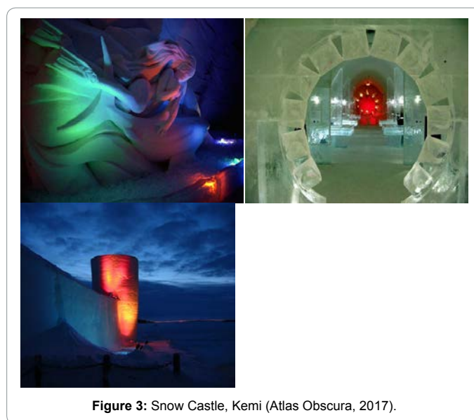
Figure 3: Snow Castle, Kemi (Atlas Obscura, 2017).

Kemi snow castle: The Castle was created in 1995 as a gift from the United Nations International Children’s Emergency Fund (UNICEF).