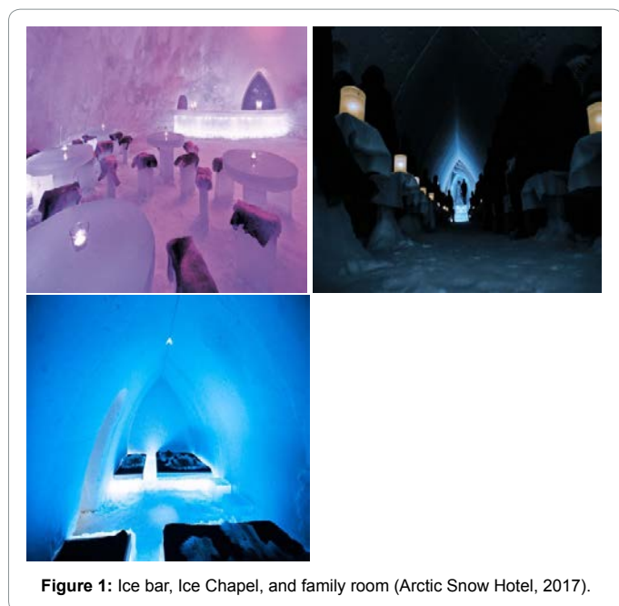
Figure 1: Ice bar, Ice Chapel, and family room (Arctic Snow Hotel, 2017).

Amidst the difficulty of fears of climate change facing snow tourism in Finnish Lapland, other aspects in the region that attract tourists