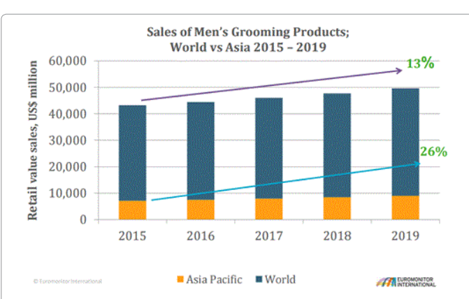
Figure 2: Asia Pacific Men's grooming continues to grow faster than global performance [1].