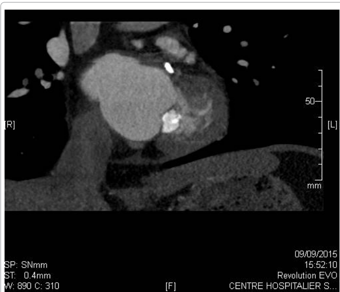
Figure 1: Cups of spiral cardiac computed tomography after injection of contrast agent.