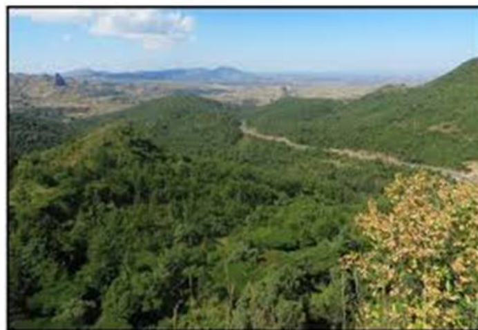
Figure 4: Aesthetic values of Alem Saga Forest.

Hospitable climatic condition of a specific tourist site is fundamental for tourism activity. Regarding, Alesmsaga Priority State Forest as per observations, FGD, interviews and questionnaires were concerned the Alesmsaga Priority State Forest and its environs have very blessed favorable climate with breathtaking walkways and camping ground. There is beautiful landscape with natural and cultural tourism resources. Therefore, eco tourists are attracted to Forest destinations for many reasons, including the hospitable climate, clean air, unique landscapes and wildlife, scenic beauty, local culture, history and heritage. According to the climatic condition of Alesmsaga Priority State Forest, it has woyina dega climatic zone. Therefore, the forest measures mean annual average temperature of ranges from 15-30 0c, and average rainfall range 1300 mm). So the climatic condition of Alesmsaga Priority State Forest is an excellent for eco tourist and these elements can give high opportunity to Alesmsaga Priority State Forest for eco-tourism development (Figure 4) [12].