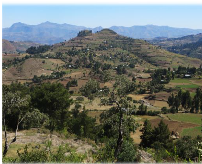
Figure 3: Farming is extremely expanded through the local community around the forest area.