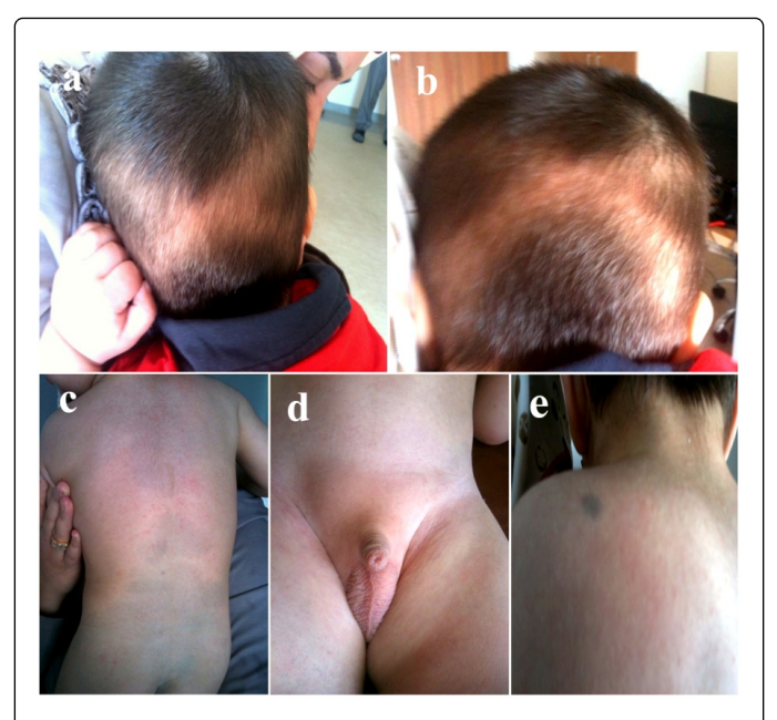
Figure 1a-e: The clinical lesions of the first patient

In the systemic examination, a cryptorchidism and micro penis were detected. In the dermatological examination of the 4-month-old child (Patient 2), a big bilateral occipito-parietal regional alopecia was seen. There were hairs only on the temporo-parietal intersections, interparietal, and mid-frontal regions (Figures 2a,b,c). No other scalp pathology was found. In the sacral location 3.5 cm above the anus, a 0.8 mm in depth sacral dimple was detected (Figure 2d). In the systemic examination, a severe penile phimosis (Figure 2e), and three big mongolian spots on the back and buttocks were seen (Figure 2f).