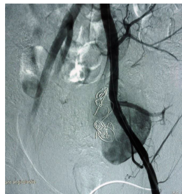
Figure 5: Arteriography showing a patency of the aneurysmal sac 6 months after embolization.