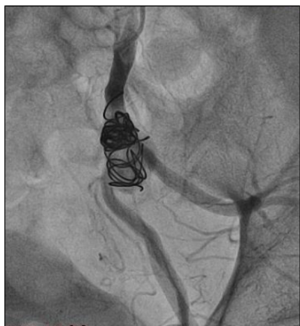
Figure 2: Embolization of the aneurysmal sac with coils.

The patient was discharged home after the second postoperative day. At 1 month follow-up, a noncontrast enhanced CT scan showed that the aneurysm was excluded (Figure 3).