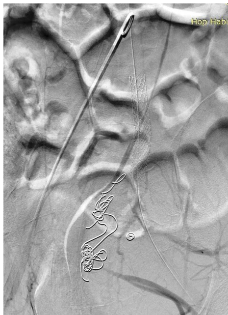
Figure 7: Second stentgraft of the left external iliac artery and exclusion of the aneurysm (arrows).

In the angiography post-implantation, an endoleak was diagnosed. So, a second distal stentgraft 10 * 38 mm was implanted in the external iliac artery (Figure 7).