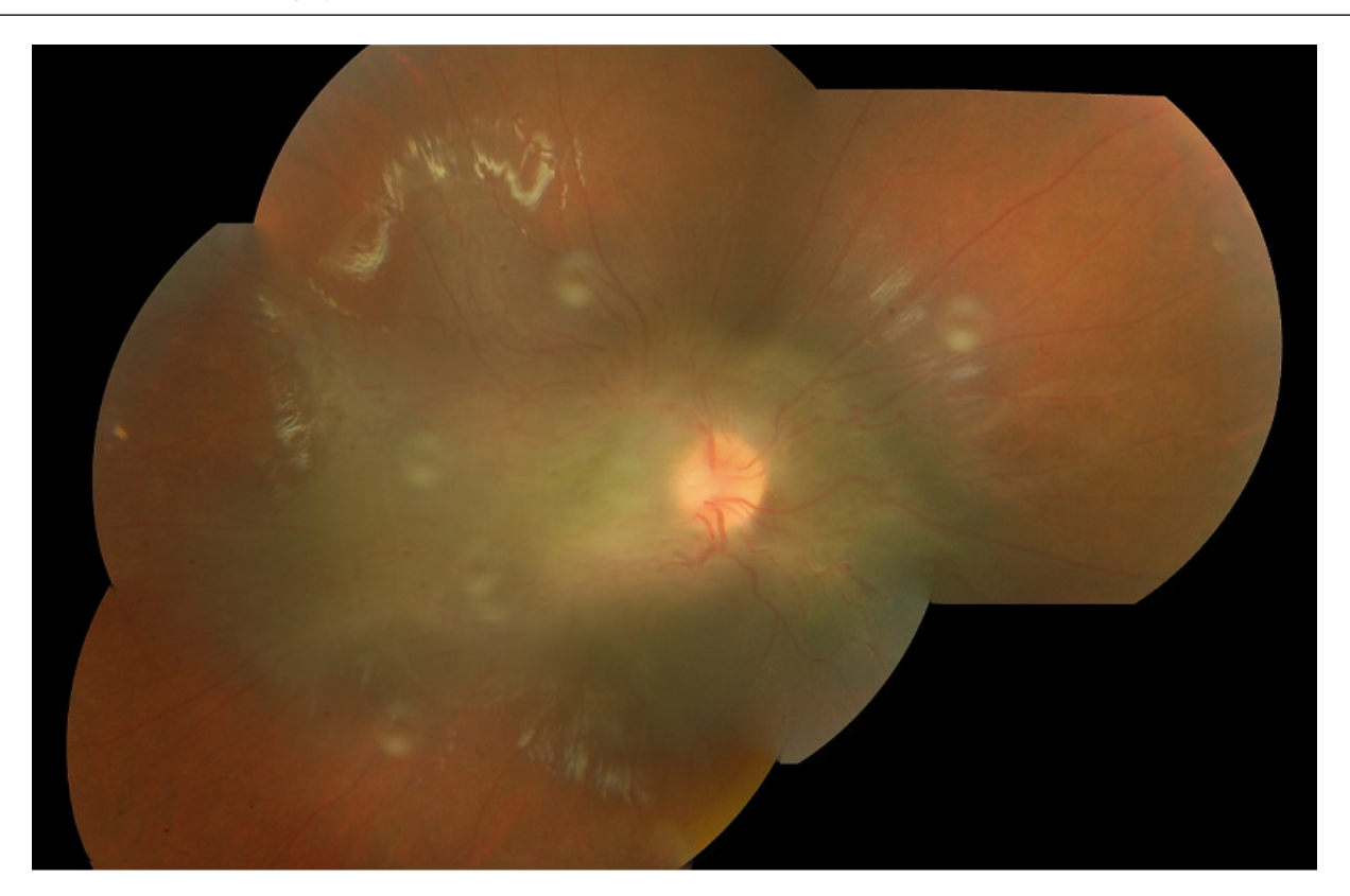
Figure 1: The ill-defined lesion is seen to extend from 2 Disc diameters (DD) nasal to the disc, to 5 DD temporal to the disc and 2 DD superior and inferior to the disc. The retina appears elevated and has a greenish grey discoloration suggestive of a thick epiretinal membrane. The ERM is causing distortion to the temporal vascular arcades.

surface suggestive of an epiretinal membrane (ERM). The temporal arcades were distorted and straightened. Ultrasonography demonstrated a plaque like retinal lesion showing high reflectivity. Optical coherence tomography (OCT) showed disorganized retinal architecture and thickening with an overlying ERM. The patient was diagnosed to have combined Hamartoma of Retina and RPE (Figures 1-3).