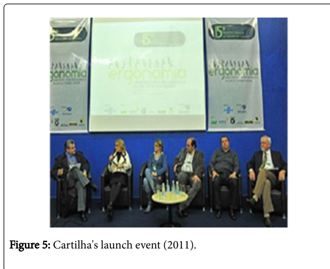
Figure 5: Cartilha's launch event (2011).

From this context it can be affirmed that the primer was an instrument of socialization and divulgation of the principles of ergonomics, being that the companies gave excellent returns in relation to the applicability of the primer as guiding actions in the daily work. Druck and Franco [2] point out that in the current reality of collective health, if one side has technologies for the prevention of easy access and public domain, on the other, in the social realm of human relations, Culture and ideology, there is a deterioration of working relationships and consequent worsening of the risks of illness and accident [5].