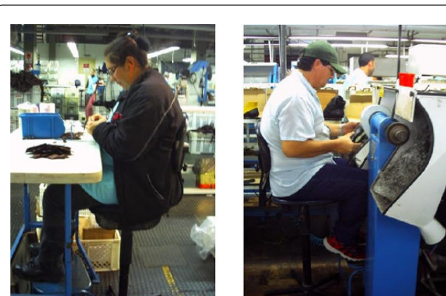
Figure 2: Jobs configured for postural alternation.

structural problems of the footwear industry in relation to accidents and work sickness. In this way, it was proposed to establish a Joint Tripartite Commission on Ergonomics. A tripartite team has a representation that legitimizes actions proposed by society, since it has representatives from the sphere of workers, entrepreneurs and the Ministry of Labor. The "Ergonomics Primer: Guidelines for Worker Safety and Health".