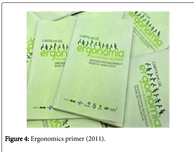
Figure 4: Ergonomics primer (2011).

In 2011, prime was widely publicized in all Brazilian shoe poles, with five seminars in several shoes producing states, including: São Paulo, including the footwear hubs of Birigui, Franca and Jaú; Minas Gerais; Ceará, Bahia, Rio Grande do Sul and Santa Catarina. The coverage in terms of the participation of workers, entrepreneurs, union representatives of workers and employers, academic community and health and safety personnel was extremely expressive. Initially six thousand booklets were printed and distributed at the launching events, and a further 10,000 were printed, which were widely distributed to technical professionals in health and safety, to academics in the area, businessmen and, mainly, to workers, at various moments in which they occurred Discussion forums. Following are Figures 4 and 5 from the Booklet and the moment of its launch in the National Seminar.