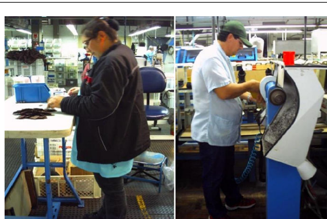
Figure 1: Activities performed in standing posture in the footwear industry.

Considering what has been contextualized so far, in the period between 2009 and the end of 2011, the Brazilian footwear industry, represented by Abicalçados, strategically sought a solution to the