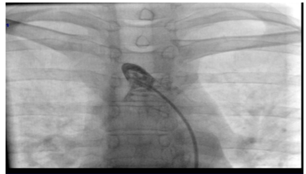
Figure 1: Aortography showing complete occlusion of brachiocephalic trunk.

carotid artery (Figure 3) there was also involvement of descending aorta showed some stenosis coronary angiogram was performed to see the effect of vasculitis on coronary beds. There were no coronary stenosis. Surprisingly we found that, there were collaterals from right coronary artery to right carotid and subclavian artery (Figure 4). Hence cerebral circulation was maintained by collaterals originating from right coronary artery. The patient did not describe any anginal symptoms.