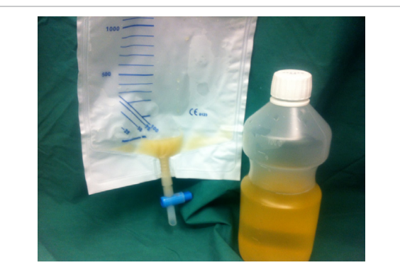
Figure 1: Clear urine emptied out into bottle before the start of the operation. Cloudy urine in urinary bag occurring after propofol anesthesia.

Investigations showed a normal microscopic examination, with presence of a few red blood cells consistent with catheterization. However, there were crystals visible under the microscope (Figure 2). These