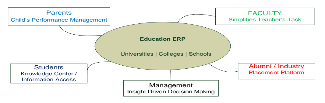
Figure 2 Education ERP