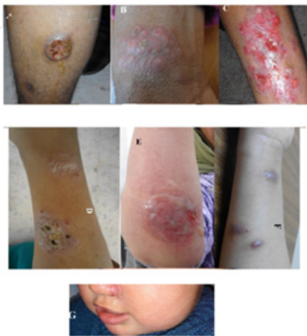
Figure 3: Clinical features of cutaneous leishmaniasis cases. a) ulcerative and crusted form of CL on the leg; b) lupoid form of CL on the forearm; c) ulcerative form of CL on the leg; d) eczematiform of CL on the leg; e) lupoid form of CL on the forearm complicated by an erysipelatoid reaction following the glucantim intraliesional infiltration; f) sporotrichoid Form of CL on the forearm; g) impetigoid form of LC on the nose.

for 63.2% of patients while 20.8% received treatment in intra-muscular thru 15 days. Cryotherapy and Plaquenil have been prescribed respectively for 10.4% and 1.6% of patients, Nine patients have refused treatment. Twenty-eight and 18 patients have been treated respectively with antibiotics and antifungal for associated infections. During follow up, complete recover was noted among 60% of cases while 12.8% have not response to treatment.