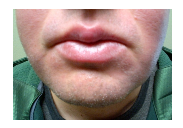
Figure 1: Persistent swelling of the bottom lip as well as the mid portion of the upper lip after several treatments with intralesional Kenalog injections (triamcinolone acetonide, 10 g/mL).

Axial CT images were collected from the palate to the iliac crest using IV contrast. Findings were unremarkable. Endoscopy performed from the nasopharynx to the glottis revealed a deviated nasal septum, but otherwise no abnormalities.