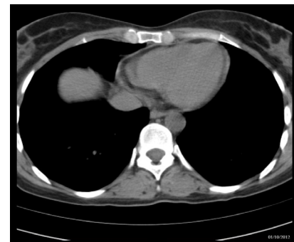
Figure 1: Computed tomography scan performed one week before the ICU admission showing a normal heart.

The patient started to have fever exceeding 39 celsius on day 15. Pseudomonas aeruginosa was isolated from deep tracheal aspirate on day 20 and antibacterial treatment was modified. Chest and abdomen computed tomographies (CT) were taken on day 25 due to persistent fever. Abdomen CT was normal, but thorax CT showed bilateral pneumonia and diffuse left ventricular wall calcification (Figure 1) that was not seen on the previous CT scan from a month ago (Figure 2). After reexamining the chest X-ray taken one day before thorax CT, a vague curvilinear calcification was noticed at the left ventricular wall (Figure 3). Previous echocardiography done two and a half months ago was normal, but the new one showed hypokinetic posterior, inferior and septal walls of the left ventricle with a 40% ejection fraction. For excluding leukemia-induced fever, a bone marrow biopsy was carried out that showed the disease in remission. The patient also