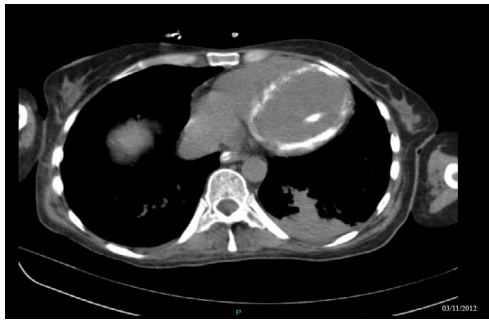
Figure 2: Computed tomography scan performed on day 25 after the ICU admission showing a diffuse left ventricular calcification.