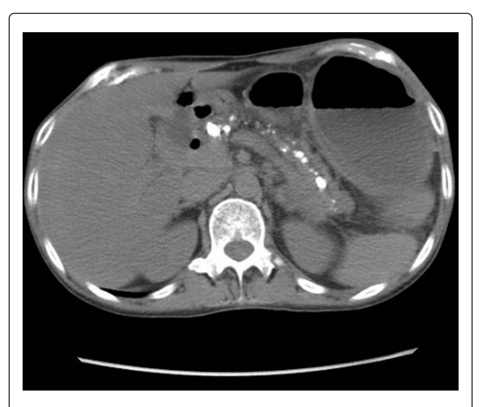
Figure 2: CT scan of abdomen showing calcification within the pancreatic parenchyma and dilatation of duct with calcification within the pancreatic duct. White arrow denoting calcification within the pancreatic duct resulting into its dilatation.

The Patient was counseled about the condition and started on oral pancreatic enzyme supplements. He gradually improved with symptomatic treatment, with increased appetite and weight gain. On follow up for two years, patient is asymptomatic with no signs of disease elsewhere in the body. He currently does not require pancreatic enzyme supplements.