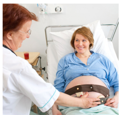
Figure 1: Explaining of the caesarean section to mother before anaesthesia.