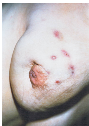
Figure 3: Sequelae of recurrent mammal abscesses.(Case 2).