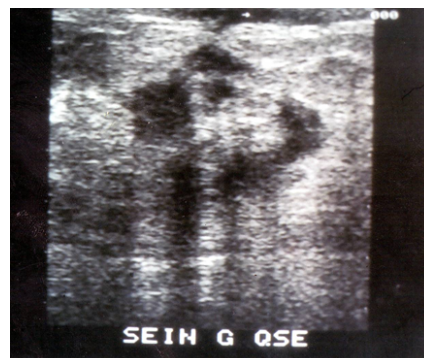
Figure 5: The mammal ultra-sonography: Tissular mammal injury heterogenic is containing multiple abscesses. (Case 2).

The diagnosis of breast tuberculosis is based on some presumptive