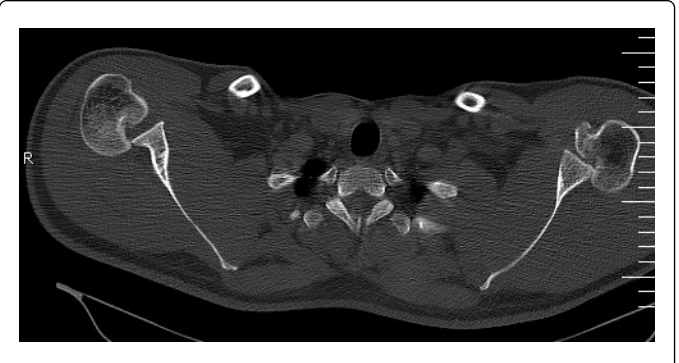
Figure 2: Semi-dislocation of both Right and Left Shoulder.