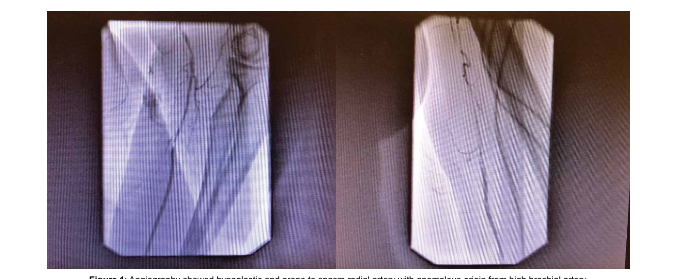
Figure 1: Angiography showed hypoplastic and prone to spasm radial artery with anomalous origin from high brachial artery.