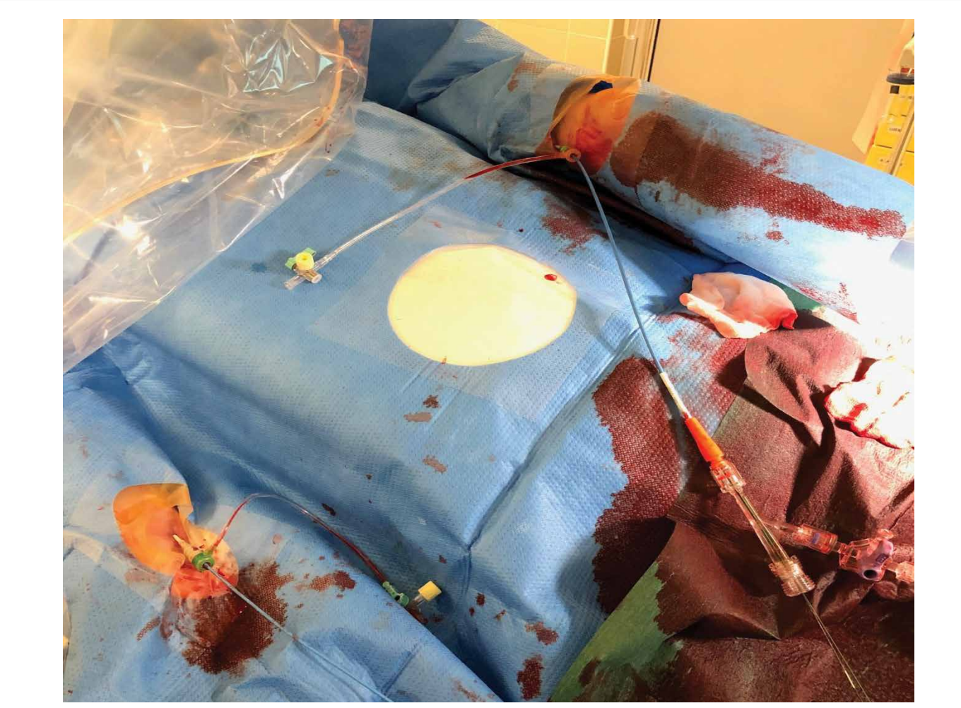
Figure 3: Bilateral trans-ulnar vascular access setting. glidesheath slender 7F on the left side, and 6F glidesheath slender in right ulnar artery with inserted catheters and PCI gear.

Citation: Kovačić M (2019) Bilateral Percutaneous Ulnar Artery Approach for Anterograde Chronic Total Occlusion Intervention. Emergency Med 9: 392. doi:10.4172/2165-7548.1000392