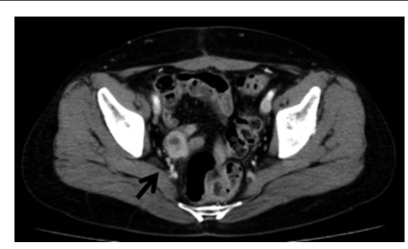
Figure 1: Computed tomography shows recurrence at the right internal iliac lymph node.

were administered, and stable disease (SD) was found according to the RECIST guideline (version 1.1). Intravenous infusion of 6 cycles of docetaxel/carboplatin/BV (docetaxel 70 mg/m²; carboplatin at 5 mg/mL•min of the AUC; BV 15 mg/kg) was administered, which resulted in CR without adverse effects (Figure 2). Seven months later, maintenance therapy with BV (15 mg/kg) was administered, and no recurrence was noted.