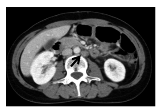
Figure 3: Computed tomography shows lymph node recurrence at the paraaortic lymph node.