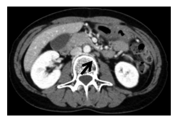
Figure 4: Lymph node recurrence size reduced to <5 mm after 6 cycles of paclitaxel/carboplatin/bevacizumab therapies.

BV has been shown to be effective for recurrence with isolated metastasis to the lymph node. Studies have shown that vascular endothelial growth factor (VEGF)-3 expression is related to lymph node metastasis [12-14]. BV is a humanized monoclonal antibody, particularly targeting all VEGF subtypes. The VEGF-3 blocking effect by BV has been demonstrated previously [15]. One paper has reported treatment of colon cancer recurrence with isolated metastasis to the lymph node using BV that resulted in CR [16]. Based on these findings, we hypothesized that BV might be effective for ovarian cancer recurrence at the lymph node.