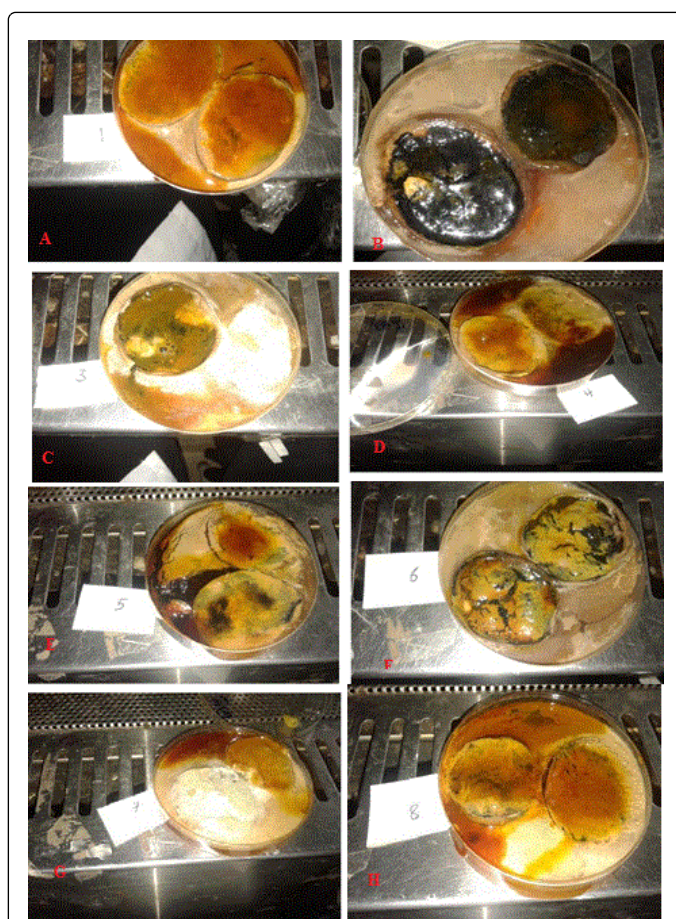
Figure 2: Application of the different fractions crushed from silica gel in the first fractionation. A: Fraction 1 B: Fraction 2 C: Fraction 3 D: Fraction 4 E: Fraction 5 F: Fraction 6 G: Fraction 7 H: Fraction 8.