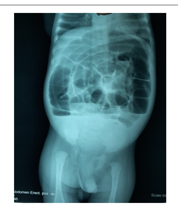
Figure 2: X-ray image examination showing multiple air-fluid interfaces.