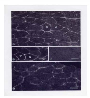
Figure 3: Immunohistochemical staining of skeletal muscle section of DIO mouse with anti-AQP7 antibody shows positive immunostaining at the myofiber surfaces (A). Most of the DIO myofibers are immunopositive with slight variation of staining intensity. More intensely stained fibers (asterisk) in A are also strongly stained with anti-AQP4 antibody in serial muscle section (asterisk in B), and therefore these myofibers are type 2 fibers. Myofibers in DIO muscles (A) are more intensely stained with anti-AQP7 antibody compared with control muscle section (C) immunostained with same antibody in which the substantial number of immunonegative myofibers are noted. The immunocontrol muscle section stained with normal rabbit IgG shows negative staining (D). Bar=50 µm (A, B, C, D).