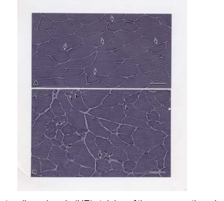
Figure 1: Hematoxylin and eosin (HE) staining of the cross-sectioned quadriceps femoris muscles of control chow-fed mouse (A) and mouse with diet induced obesity (DIO) (B). In control mouse muscle (A), the scattered myofibers (arrow) with slight granular sarcoplasmic appearance and slit like structures are seen. The DIO muscle (B) contains scattered angulated small diameter myofibers (arrow head) and apparently degenerating myofibers (arrow) in which non-homogeneous sarcoplasmic appearance, slit like structures, and / or surface indentation are observed. Bar=50 µm (A,B).

Recently leptin has been shown to down-regulate the AQP7 function through the phosphatidylinositol 3 kinase/Akt/mammalian target of rapamycin pathway in human visceral adipocytes and hepatocytes [15]. We thought that up-regulated expression of AQP7 in the skeletal muscles of obese leptin deficient ob/ob mice is mainly depending on their lack of leptin. However in obese humans, Considine et al. reported that serum immunoreactive leptin levels were up to four times higher than in normal-weight subjects [21]. In animal experiments, even in isocaloric diets, leptin levels were higher in rat group fed with either the high fat diet or the high protein diet compared with those fed with the high carbohydrate diet [22]. In addition leptin and insulin concentrarions of mice with DIO were also described to be high in comparison with those of control mice [23,24]. Even under the circumstances of the elevated concentrations of leptin and insulin, both of which suppress the expression of AQP7 [15,25,26] through the