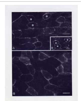
Figure 4: Immunohistochemistry of skeletal muscle section of DIO mouse with anti-AQP9 antibody reveals the presence of scattered myofibers with positive immunostaining at their fiber surface (A). These AQP9 positive myofibers (asterisk) in A are also immunopositive with anti-AQP4 antibody in serial muscle section (asterisk in B), and are type 2 fibers. Control muscle section of chow-fed mouse (C) immunostained with anti-AQP9 antibody shows similar immunostaining appearance to the DIO muscle section (A). Bar=50 µm (A, B, C).

phosphatidylinositol 3 kinase pathway, the AQP7 expression of skeletal muscles of mice with DIO was up-regulated in our present study. Taking our findings of leptin deficient ob/ob mice [14] into consideration, the serum concentration of leptin seems to have no relation to the increased expression level of AQP7 in the skeletal muscles both in DIO and ob/ob mice. Since DIO is associated with hyperinsulinemia and insulin-resistance, it seems plausible that the increased AQP7 in myofibers is related to altered insulin signaling in the skeletal muscle. It is also possible that other substances than leptin and /or insulin may up-regurate the expression of AQP7 in the skeletal muscles of these obese mice. For example, enhancement of the aquaporin adipose (AQP7) gene expression by a peroxisome proliferator activated receptor \gamma (PPAR \gamma ) was reported [27]. The skeletal myofibers such as regenerating myofibers have the peroxisome which was observed by electron microscopy [28]. Kruszynska et al. [29] reported that skeletal muscle contains two isoforms of PPARy (PPARy1 and PPARy2) which