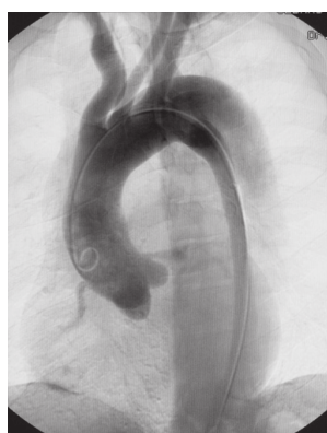
Figure 3: AD aortogram.

The aortogram reveals accurate diagnosis of aortic dissection in over 95% of patients and assists the surgeon in planning the repair. The benefits include visualization of the true and false lumens, intimal flap, aortic regurgitation, coronary arteries, arch vessels, and the extent of the dissection. The disadvantages include the need to transport the patient to radiology, the use of contrast dye in patients who may have renal insufficiency, and the invasiveness of the procedure. Although still considered by some as the diagnostic standard test, it is being replaced by newer imaging modalities [21] (Figure 3).