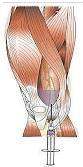
Figure 3: Illustration of an adductor canal block in distal third of the canal.