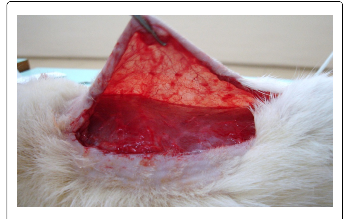
Figure 1: Lateral incision for insertion of the meshes in onlay position

In the evaluation of the prostheses placed in both the anterior abdominal wall muscles (onlay) and the position intraperitoneal (underlay) position was no loss of display quality in all devices used.