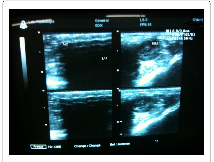
Figure 5: MO: mesh PTFEc in onlay position images on the left with posterior acoustic shadow (PAS) and right mesh without showing the kidney in normal position

Since the analysis after inflammatory process could influence the image and degree of attenuation of the ultrasound beam.