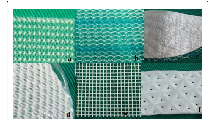
Figure 2: Different types of meshes used: a) Polypropylene, b) Polypropylenepolyglecaprone, c) Polypropylene-polydioxanon/ cellulose oxidized regenerated, d) Polyester/collagen and) polyester, f) condensed polytetrafluoroethylene (PTFEc)

The analysis of the meshes in the attenuation was no difference between the meshes in the same position with p<0.001 and p=0.001 for onlay to underlay (Figure 2 and Table 2).