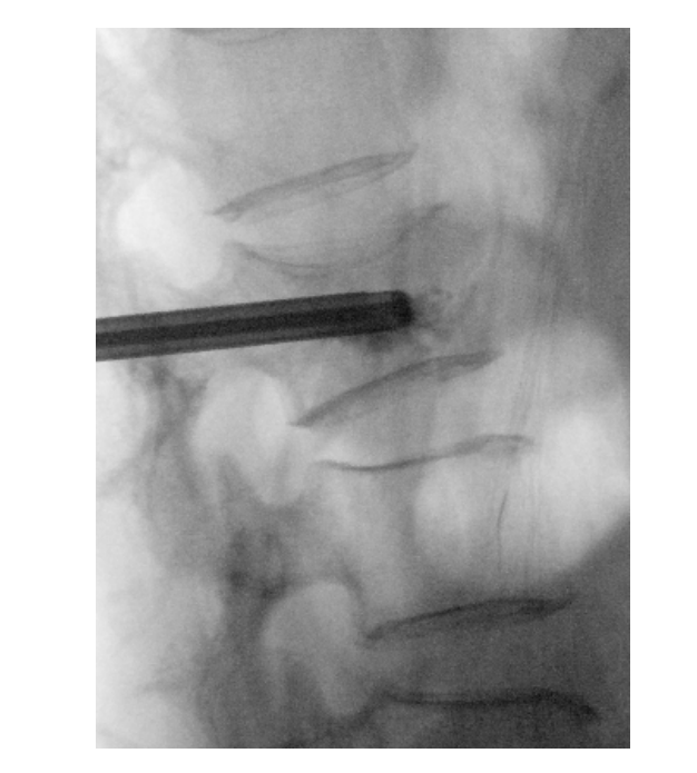
Figure 1: PVP of one vertebral body. Lateral fluoroscopic project of spine demonstrating cement that just came out of the trocar inside the vertebral body.

The patient population included 97 patients, 14 male and 83 female, aged 51 to 92 years (73.1 on average). Informed consent was obtained from all the patients before enrollment in the study. This study was retrospectively performed and approved by the institutional Ethics Committees of our hospital and conducted in accordance with the ethical guidelines of the Declaration of Helsinki. And written informed consent was given by participants for their clinical records to be used in this study. All patients were diagnosed of acute osteoporotic vertebral compression fracture or chronic fracture that has not healed, confirmed by MRI. All patients met the following criteria: (1) one or more OVCFs; (2) focal back pain in the midline; (3) conservative treatments they received have not been efficacious; (4) back pain related to the location of the VCF on radiography; (5) the presence of bone marrow edema on magnetic resonance imaging (MRI) T2weighted short-tau inversion recovery sequences in the corresponding collapsed vertebral body.