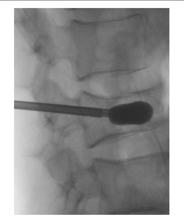
Figure 2: PKP of one vertebral body. Lateral fluoroscopy view-the balloon is inflated under manometric control to restore the collapsed endplate to its normal position and to create a cavity within the vertebra.

tamp Figure 2), bone cement was injected into the vertebral body in a slow and smooth manner. Fluoroscopy with C-arm was frequently used to monitor the injection in order to prevent the leakage of bone cement from the vertebral body.