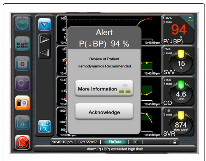
Figure 2: Hypotension probability indicator (HPI).

Vigileo system, based on arterial waveform analysis, and patient's age, sex, height, weight is often used in FF reconstructive surgery as mini invasive and reliable [38]. As additional parameter, the recent "Hypotension Probability Indicator" (HPI) could be promising: the advantage to predict a drop in the mean arterial pressure, before hypotension occurs, can be more effective than a fluid therapy titrated to maintain SVV less than 13% [39]. Prospective studies are required to investigate the relationship between HPI and flap perfusion in theatre (Figure 2) [40].