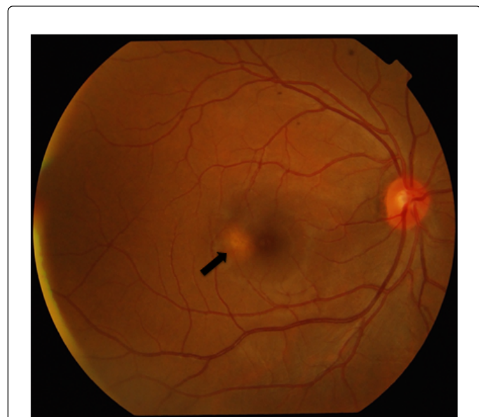
Figure 1: Colour fundus photograph of right eye showing a choroidal tuberculoma at the macula (black arrow).

are similar to the tubercles elsewhere in the body and show mononuclear infiltrates, granuloma (Figure 2) with caseation necrosis that may contain acid-fast bacilli [23-25].