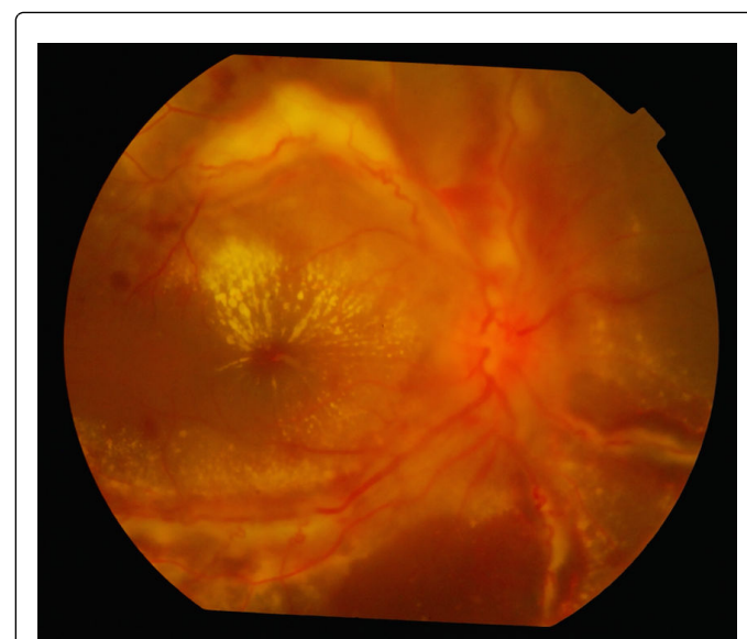
Figure 3: Colour fundus photograph of the right eye showing hyperemic disc with extensive vasculitis, retinal hemorrhages and hard exudates with macular star formation.

Retinal vascular inflammation is commonly seen in association with TB [33-35]. Retinal vasculitis mainly involves the veins and is often seen as a severe perivascular cuffing with infiltrates and vitritis (Figure 3). When associated with a focal active or healed chroiditis lesion along the inflamed vessel, a tubercular etiology is very likely to occur [2]. Macular star and optic disc edema may be seen, complicating tuberculous retinal vasculitis [33]. Tubercular retinal vasculitis often causes extensive peripheral retinal ischemia resulting in retinal neovascularisation. Retinitis usually occurs concomitantly with choroiditis causing a retinochoroiditis [2].