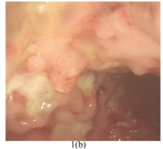
Figure 1: Multiple isolated ulcerative lesions and inflammatory changes of the colon with numerous polyps.