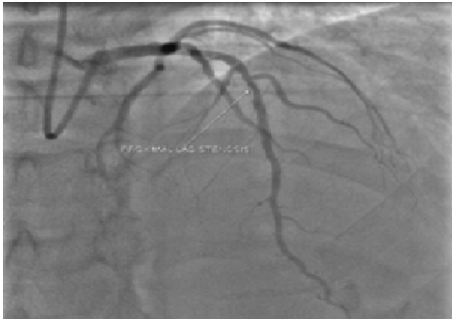
Figure 2: Coronary artery angiogram.