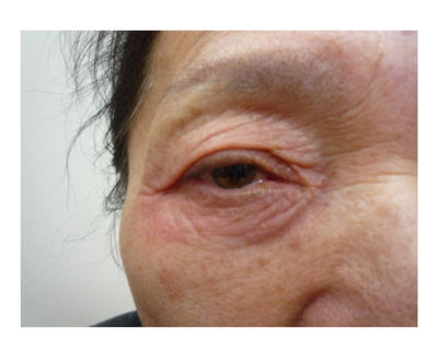
Figure 2: Conjunctival and lid skin injections (Next day).

The mechanisms by which these reactions occur are complex, with many levels of fine control. ACD arises as a result of two essential stages: an induction phase , which primes and sensitizes the immune system for an allergic response, and an elicitation phase , in which this response is triggered [2]. As such, ACD is termed a Type IV delayed hypersensitivity reaction involving a cell-mediated allergic response. Contact allergens are essentially soluble haptens and, as such, have