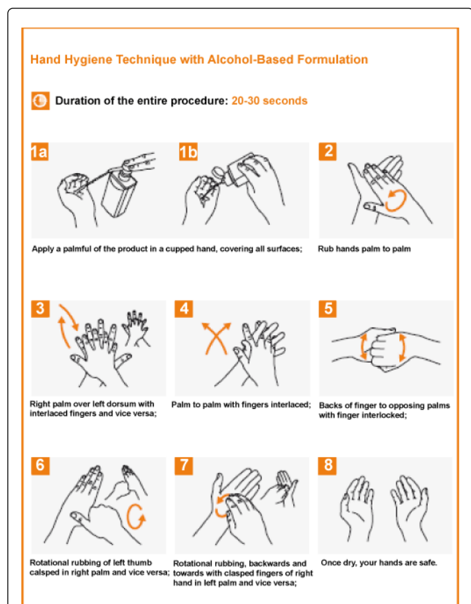
Figure 1: Alcohol-Based Handrub technique according to WHO guidelines.

The technique for hand rub performed according to the WHO is illustrated in Figure 1.