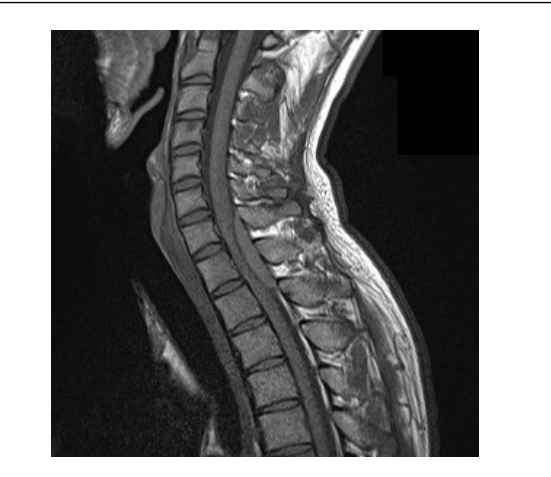
Figure 1: T1-weighted saggital magnetic resonance image: Isointense mass compressing the posterior aspect of the spinal cord from C7 to Th2.

showed acute compressive posterior spinal epidural hematoma from C7 to Th2 vertebra causing compression of the spinal cord and nerve roots. MRI imaging showed relative iso-intense lesion on T1 sequence (Figure 1) which was hyperintense on T2-weighted images (Figures 2 and 3). In the first 12 hours since the symptoms onset, urgent operation was performed-decompressive laminectomy (from C7 to Th2) with the removal of the epidural hematoma. No pathological blood vessels or hemorrhagic tumors have been noted during the operation. Postoperatively, muscle strength recovered well (4/5 grade) in all four limbs with return of the bladder sphincter control. After physical rehabilitation full muscle power was recovered in every limb. Post-operative follow-up CT of cervical and thoracic spine revealed adequate cord decompression. Intra-hospitaly both CTA and DSA were performed and both came back negative.