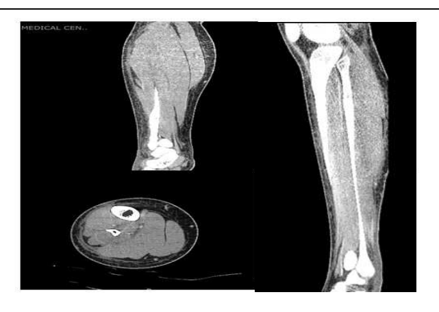
Figure 2: CT Leg W Contrast: Subcutaneous soft tissue swelling and edema most pronounced at the lateral aspect of the lower. leg. No organized focal fluid collections or rimenhancing abscess detected. No soft tissue air to otherwise suggest necrotizing fasciitis as clinically questioned.

Intra-compartmental pressure monitoring showed lateral compartment at 58 mmHg, anterior compartment at 38 mmHg, diastolic pressures prior to anesthesia were 67. Delta pressure was 9 mmHg in lateral compartment, 29 mmHg in anterior compartment, no signs of posterior compartment syndrome.