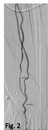
Figure 2: Digital subtraction angiography of the left forearm (with angiographic catheter placed at the same site as on Figure 1.) at the time of termination of operative procedure (approximately after 3 hours). Vasospasms of radial artery with absence of flow distally are still seen (arrows).