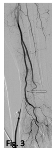
Figure 3: Digital subtraction angiography of the left forearm (intraarterial retrograde contrast injection through the arterial line) after intraarterial nitroglycerin application. Immediate restoration of normal patency of entire radial artery is obvious (arrow).

The recovery was uneventful; the left hand was of appropriate color, painless and warm. Capillary refill, sensation and motoric properties of the hand were normal (Figure 4).