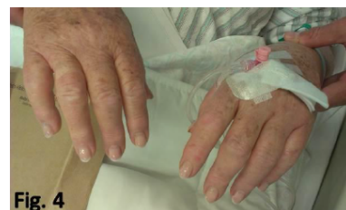
Figure 4: Sensation and motoric properties of the hand.

The recovery was uneventful; the left hand was of appropriate color, painless and warm. Capillary refill, sensation and motoric properties of the hand were normal (Figure 4).