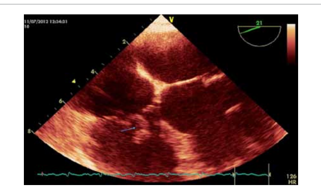
Figure 1: The accessory tricuspid valve leaflet on transesophageal echocardiogram.

A 36-year-old female without previous cardiac history underwent cardiac examination as part of a check-up. Physical examination and electrocardiographic, chest radiographic and laboratory values were within normal ranges. The transthoracic echocardiogram performed as part of a cardiac check-up revealed a large mobile mass on the septal leaflet of the tricuspid valve. The transesophageal echocardiogram showed a markedly redundant, elongated tricuspid valve leaflet that prolapsed into the right atrium (Figure 1). Surgical resection was performed because of the large size and mobility of the mass and the risk of subsequent embolism or obstruction. During the operation, after right atriotomy, redundant ATV tissue was observed on the septal leaflet of the tricuspid valve. This mass had some chordal attachment to the ventricular septum and right atrium. The mass was carefully resected using the saline injection test. The gross appearance of the resected tissue was similar to normal valve tissue (Figure 2). After resection, a ring was implanted, and suture valvuloplasty of the remaining valve leaflets was performed. The histopathologic analysis of this resected tissue showed an endocardial layer covering hyalinized fibrovascular tissue, which confirmed ATV (Figure 3). The hospital course was uneventful, and the patient was discharged on the 6th day in good condition.