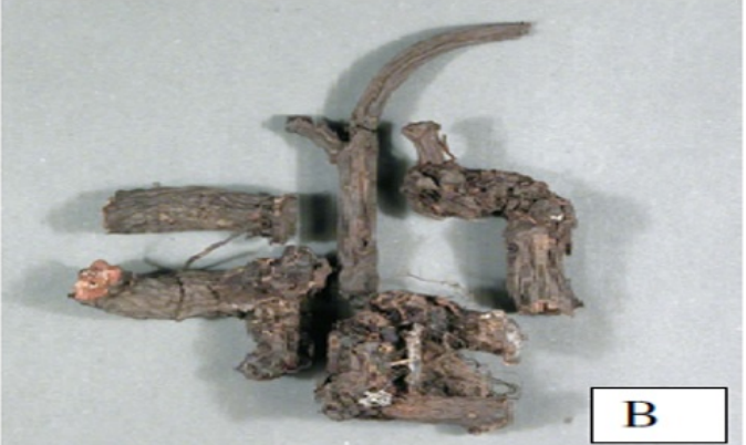
Figure 2: A: G. wallichianum B: Picea smithiana.