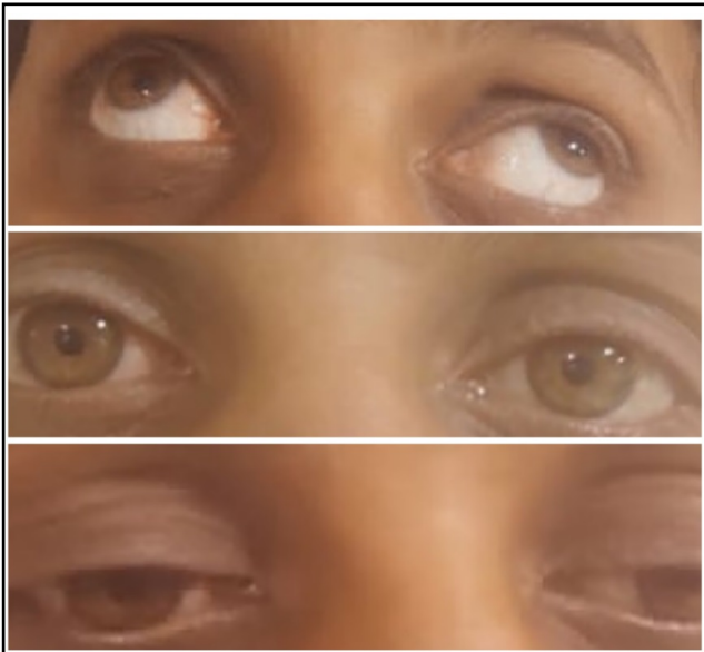
Figure 1: V pattern exotropia.

A 28-year-old female visited our department with a history of itching bilateral eyes off and on. No other significant history was given. Her visual acuity was 6/6 in both the eyes while the fundus, color vision, slit lamp examination and intraocular pressure were within normal limits. The only positive finding was a V pattern exotropia (Figure 1) on torch examination about which the patient had no concern and hence further ocular investigations were not done. She was prescribed ocular lubricants plus was told to undergo a Computed Tomography (CT) scan of the brain and orbit for which she agreed. Asymmetric size of the muscle belly of Lateral Rectus (LR) muscle was reported on CT scan (Figure 2). No further intervention was done. Our case highlights an asymmetric size of the muscle belly of lateral rectus muscle which is a very rare finding.